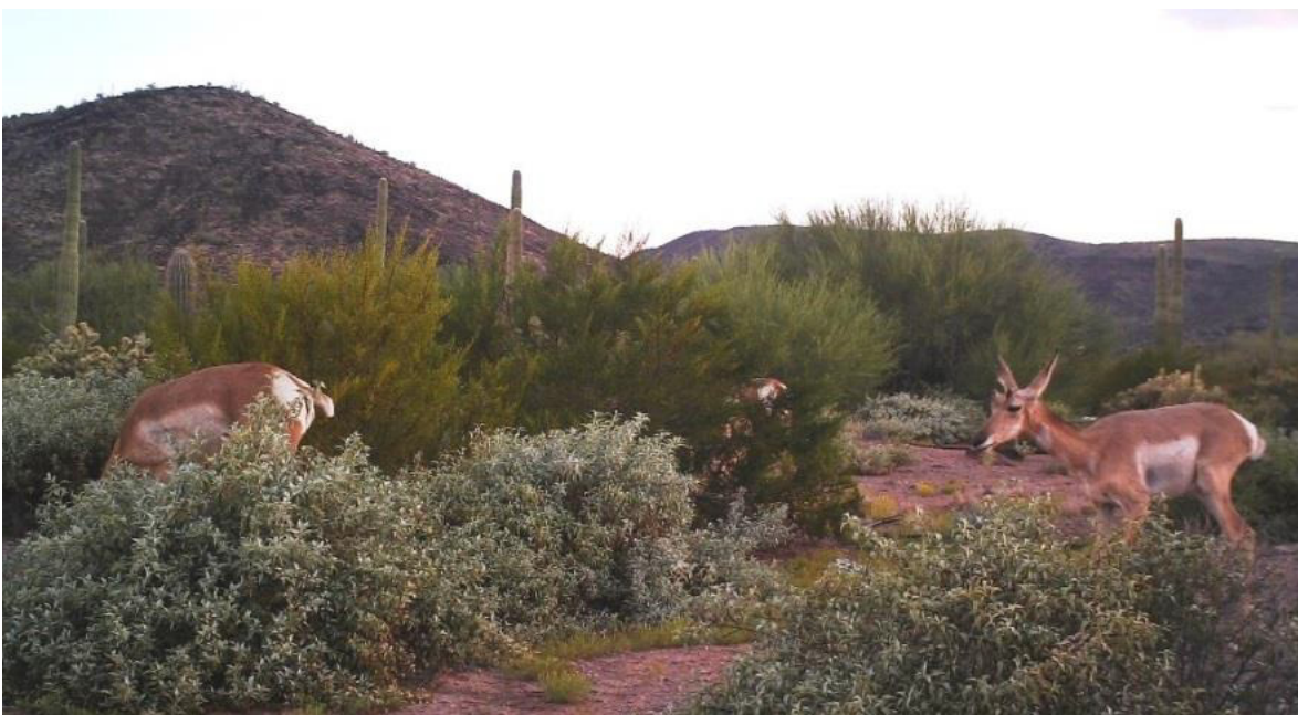
Pronghorn feeding at Lower Well forage enhancement.