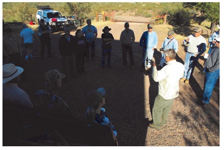
(Malpai Project continued from page 5)