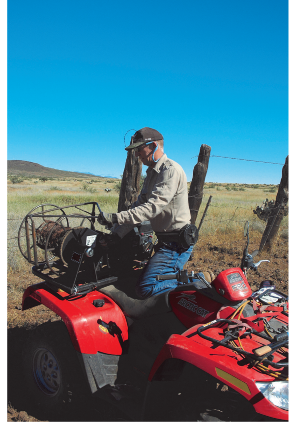
Pronghorn Volume 18, Number 4