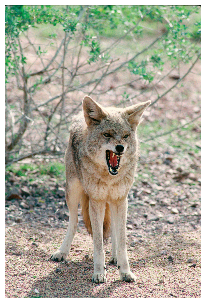
Managing the effects of coyotes and other predators on prey such as pronghorn is a challenge.

The science of wildlife management continues to evolve, building on knowledge gained through research and management. When the Arizona Game and Fish Department takes an action, such as to pursue a translocation to extend the range of a species, it is a result of a management decision. Similarly, taking no action in a particular instance, such as deferring that same translo-