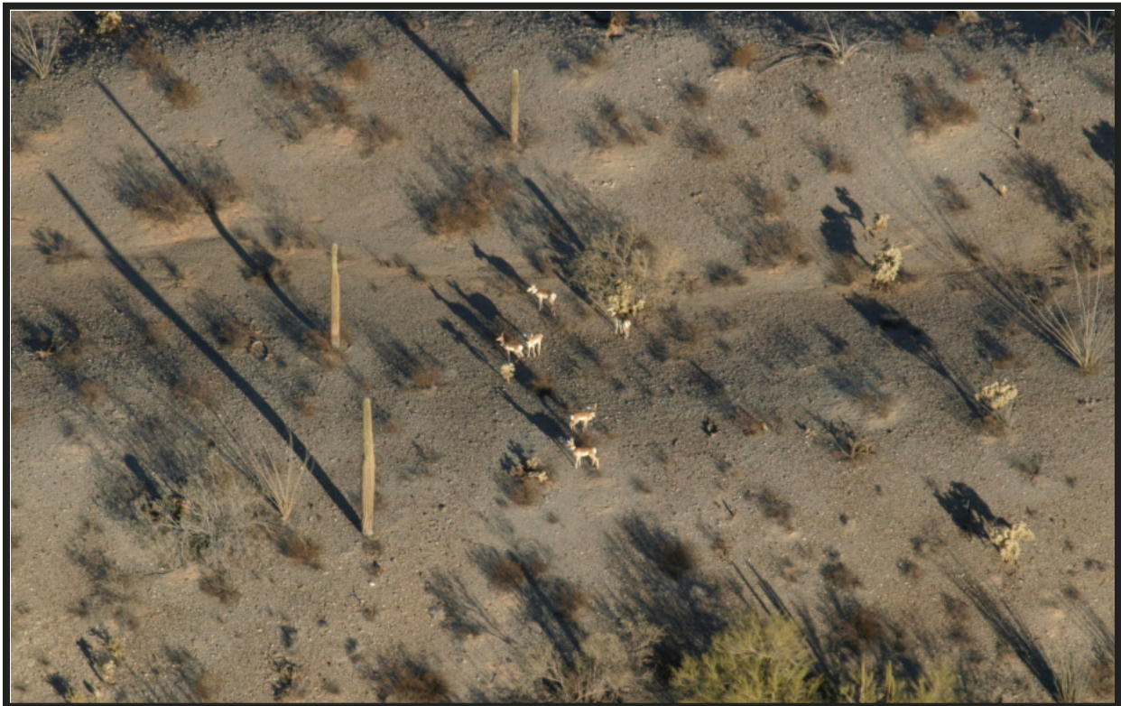
Group of bucks released from the pen in the wild.

Wild Pronghorn: On the most recent telemetry flight, we saw 28 pronghorn on north and south Tac, including 4 radio-collared animals. A group of 7 is using a green area on the western side of the Mohawk Valley, and a group of 7 were south of the Granite Mountains forage plot. Two of the newly released pronghorn were in a group of 8 in the Agua Dulce Mountains, and one newly released pronghorn was in a group of 11 in Organ Pipe NM. A group of 9 newly released pronghorn was with a buck released last year north of the pen. Most of the pronghorn range is extremely dry and the pronghorn are using the few greener areas.