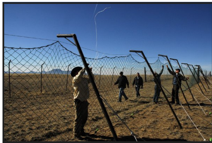
(Continued on page 14)

We had to park in a designated corral area and walk to the actual capture site about a half mile. Once there we all split into semi organized groups and began various tasks. We spent the day pounding fence posts, erecting fences, wiring fences up, welding damaged fence posts, installing gates, erecting 8' posts and 8' netting, securing the round pen, installing the divider curtain and