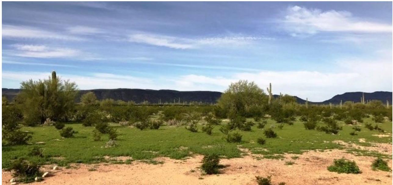
Cabeza Prieta captive breeding pen, February 2017

The pronghorn in Cabeza pen continue to do well. There were 2.1 inches of rain in February with one large storm on February 18/19 dropping 1.7 inches. The washes flowed but no major damage occurred. The perimeter fence in one of the wash areas was bent over quite a bit but still standing; consequently the t-posts were re-pounded into the ground. Removal of debris from the fence in several areas was also required. Several smaller rainfall events added to the total. The pen and surrounding desert areas are extremely lush with a carpet of forbs. The pronghorn have almost entirely stopped eating alfalfa and are feeding on native forage in the pen. No newborn fawns have been observed yet.