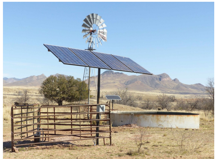
Solar well, Hart Pasture, Babocomari Ranch