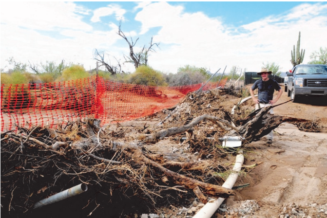
Damage from the storm on the west side of the pen