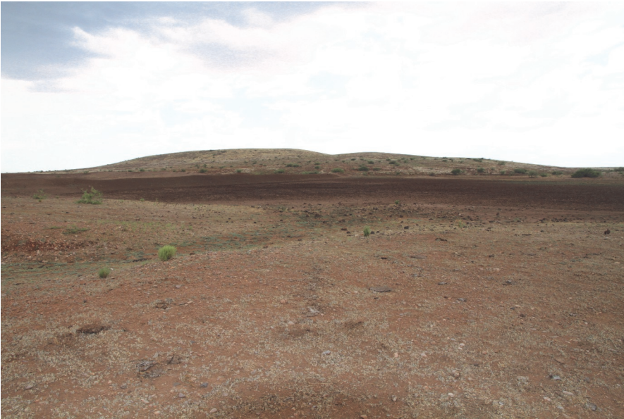
Malpai Tank – HPC Reservoir Cleanout proposal, located on IV Bar Ranch in San Bernardino Valley, in prime Pronghorn habitat. Cleanout capacity after cleanout to exceed 8 million gallons