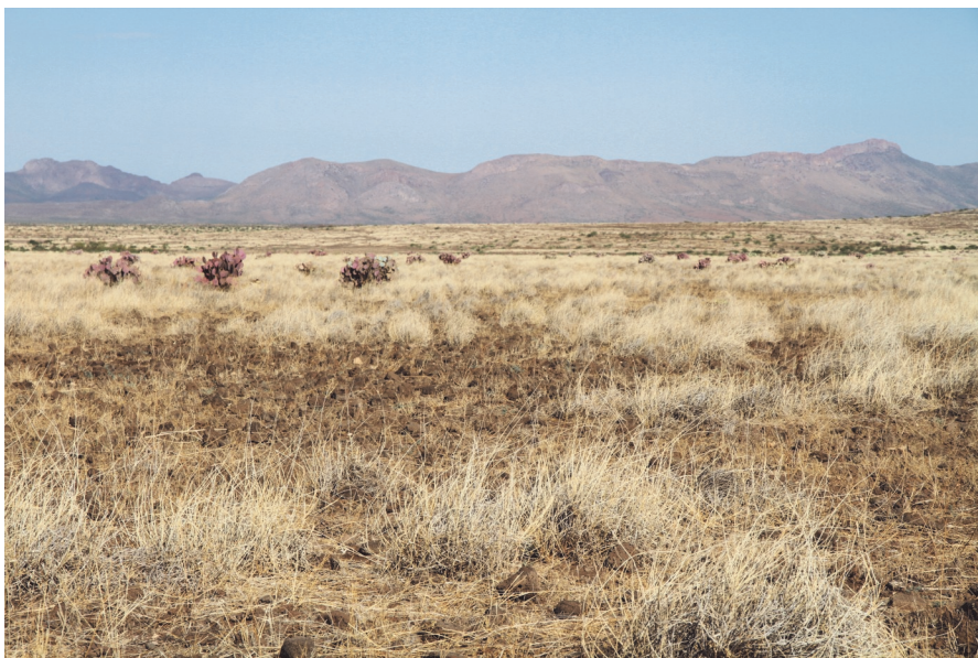
Malpai Ranch Pronghorn Habitat