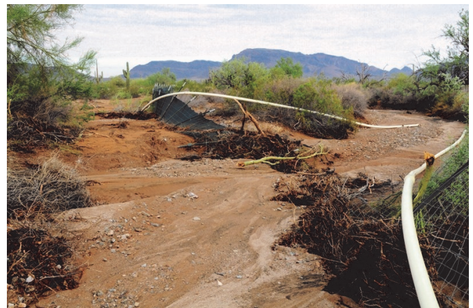
Damage along the midline fence, showing debris, missing fence, and broken irrigation pipe.