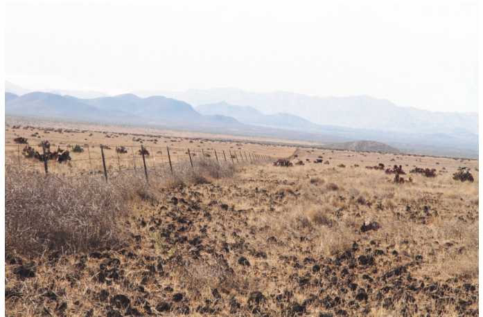
Potential connectivity fence project on Malpai Ranch

These efforts by many will continue to drive the effectiveness of the AAF's southeastern Arizona Initiative. Various funding sources, including HPC and NFWF will provide the financial stimulus to make these necessary projects a reality. Partnerships and the willingness to work together will foster project development, which will enhance grassland habitats and allow pronghorn populations to rebound.