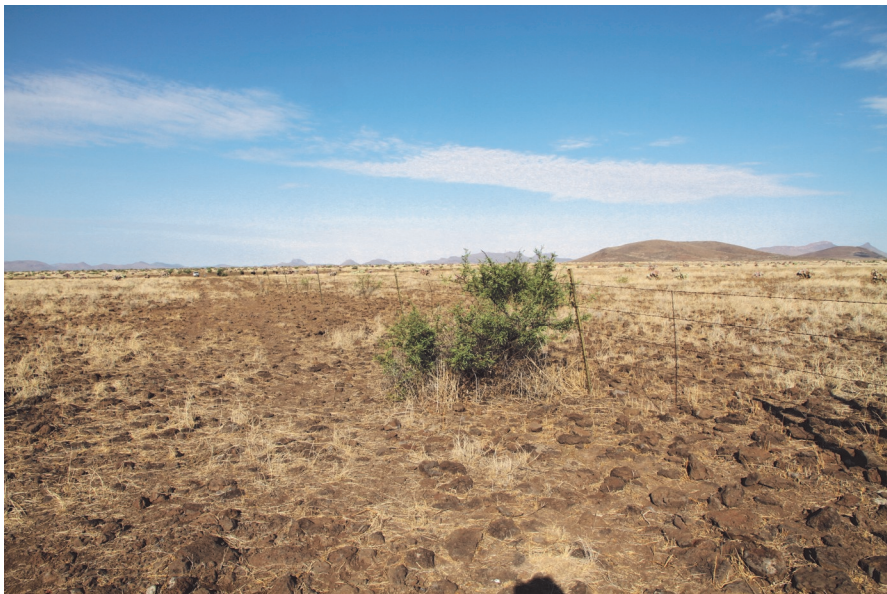
Malpai Ranch fence project site set for September 29th