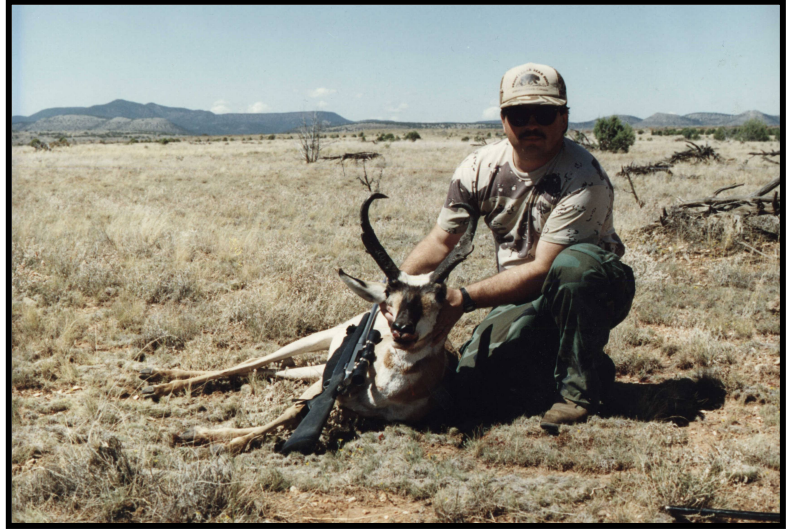
Chino Valley Circa 1993