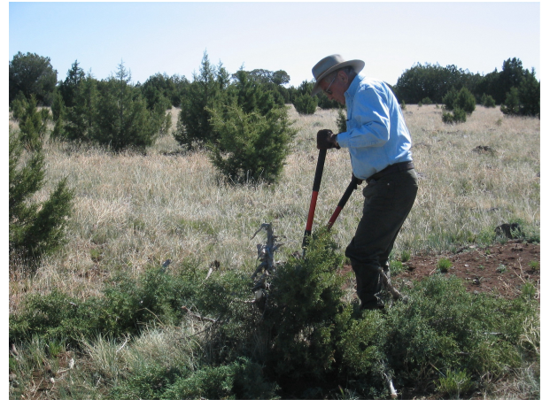
AAF Past President annihilates an unknowing juniper!