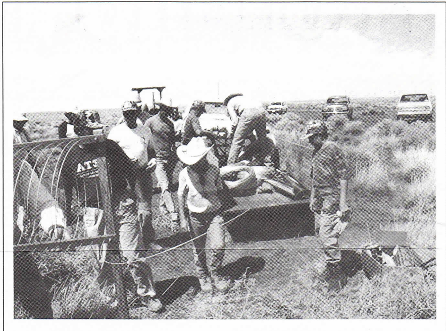
AAF work project in Unit 5A

3875 N. 44th Street, #102 Phoenix, AZ 85018 (602) 952-8116 • FAX (602) 952-8230